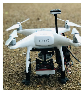
Figure 1: MicaSense RedEdge-MX camera integrated into the DJI Phantom 4 drone.

This work has been partly funded by Digital Futures and the Swedish Research Council (Grant 2018-05024 ).